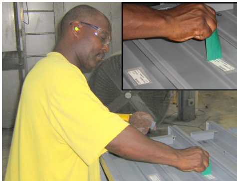
Mask comes off—ready for customers!