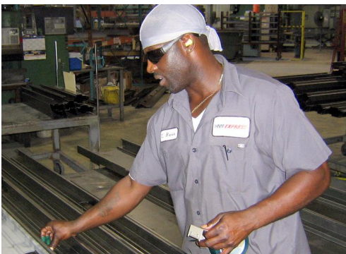
Labels and mask go on at projection

That is a "Thanks" to all who helped to implement the new labels!